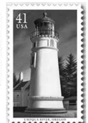
Example of Commemorative