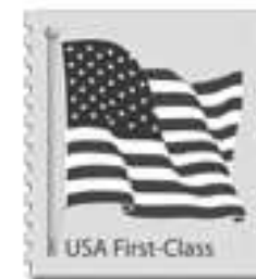
Example of Definitive

Commemoratives are available at your local post office or on-line at http://shop.usps.com .